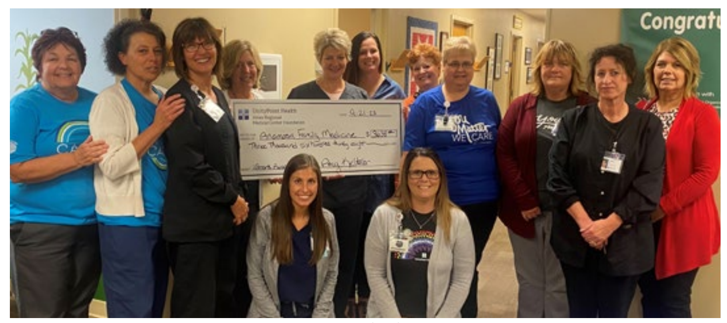
Anamosa Family Medicine