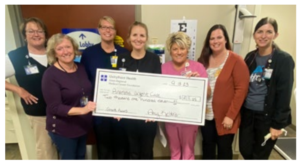
Anamosa Urgent Care