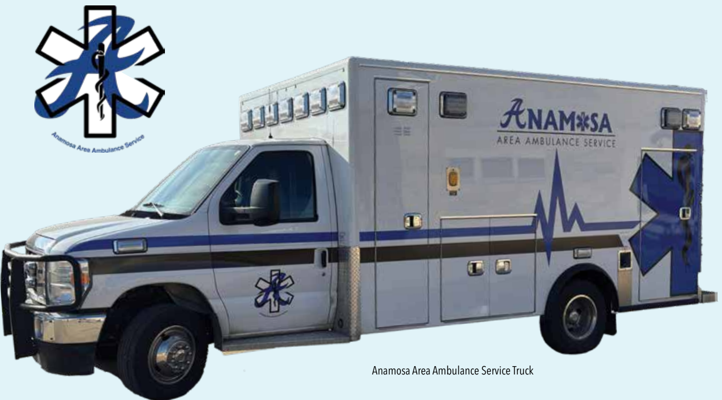
Anamosa Area Ambulance Service Truck

Thank you for considering our request and for your unwavering support of the Anamosa Area Ambulance Service. Together, we can ensure that our community continues to receive top-tier emergency medical care.