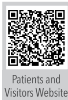
Patients and Visitors Website

▶ Interpreters: Interpreter services are free and provided virtually for many languages. Contact a member of your care team for assistance.