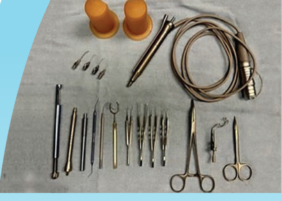
Cataract Tray - With the purchase of additional cataract trays and steri containers, the surgery team can now perform 22 cataract procedures in a day with no delay.

"Our commitment to advancing surgical care is a testament to our dedication to patient-centered care and a reflection of our mission to improve the health of the people and the communities we serve," said Grannon.