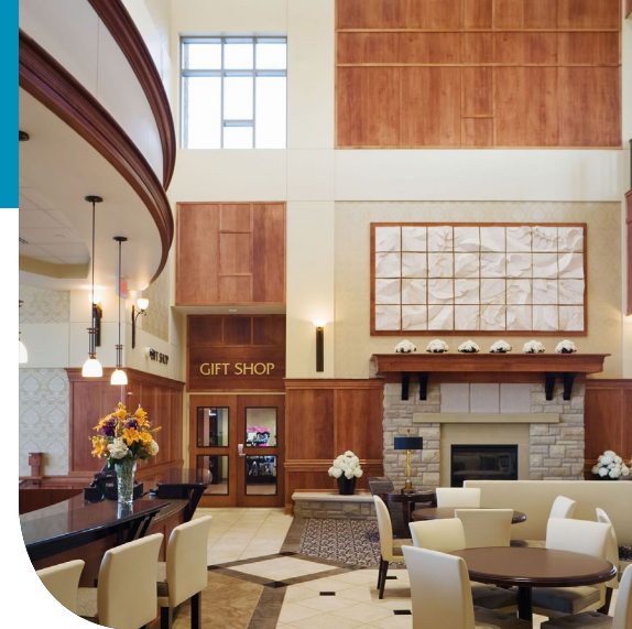
Methodist West Lobby