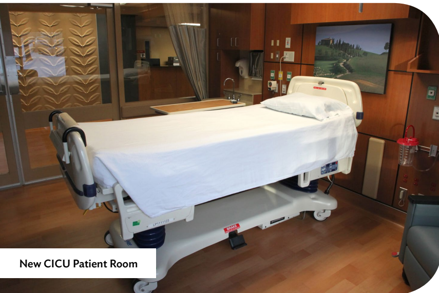
New CICU Patient Room

“I have the best staff of nurses who continually provide the highest quality of care to some of the most sick patients. We now have a critical care unit that truly reflects our quality of care.”