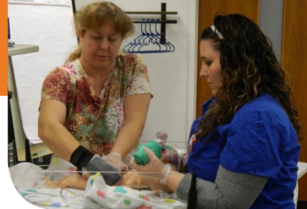
Nurses perform mock procedures on a simulation newborn