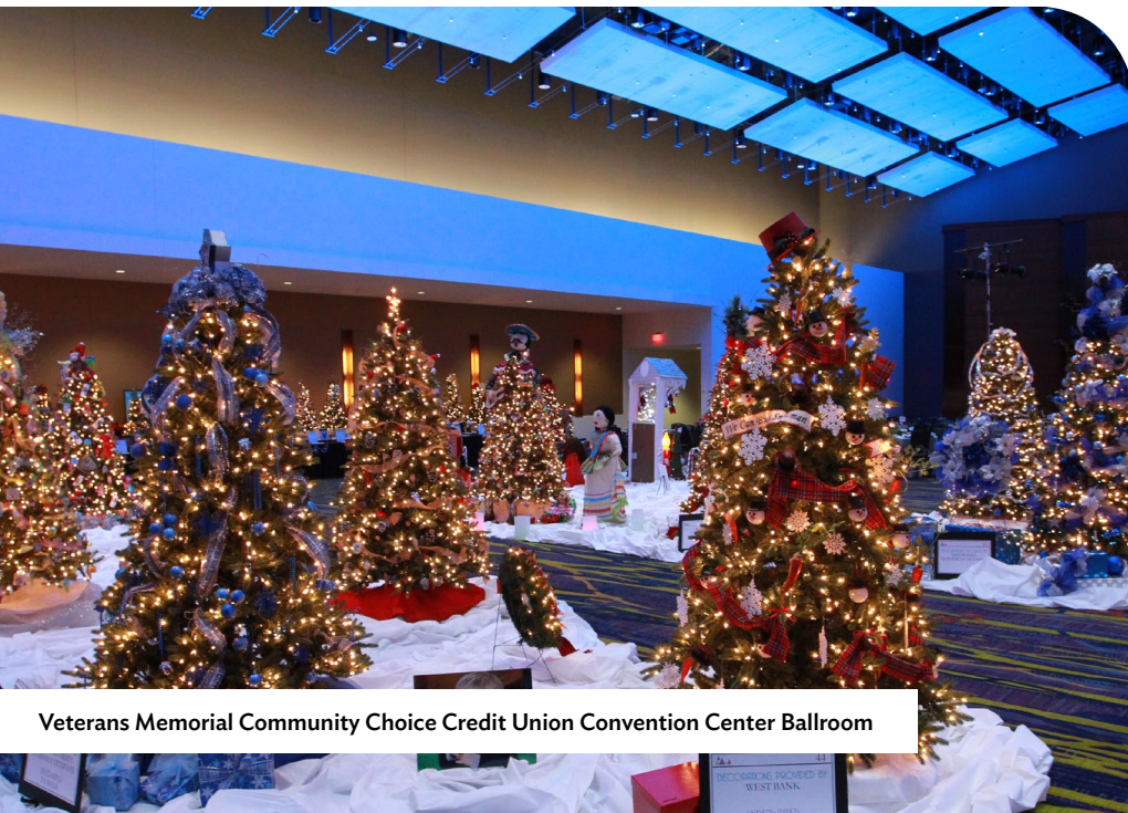
Veterans Memorial Community Choice Credit Union Convention Center Ballroom