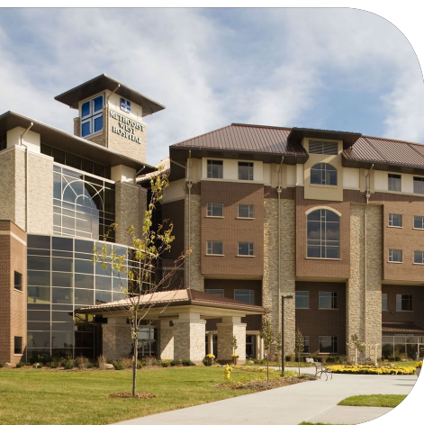
Methodist West Hospital

“MAY I HELP YOU?” Upon entering the doors of Methodist West Hospital, this phrase is one of the first things you will hear. These four simple words come from our dedicated volunteers, wearing blue jackets, who are ready to help our patients, families and guests in whatever way possible. Whether it is a planned surgery or a trip to the Emergency Room, coming to the hospital can be stressful, scary and confusing. The volunteers at Methodist West Hospital do everything they can to make the patient experience as positive as can be.