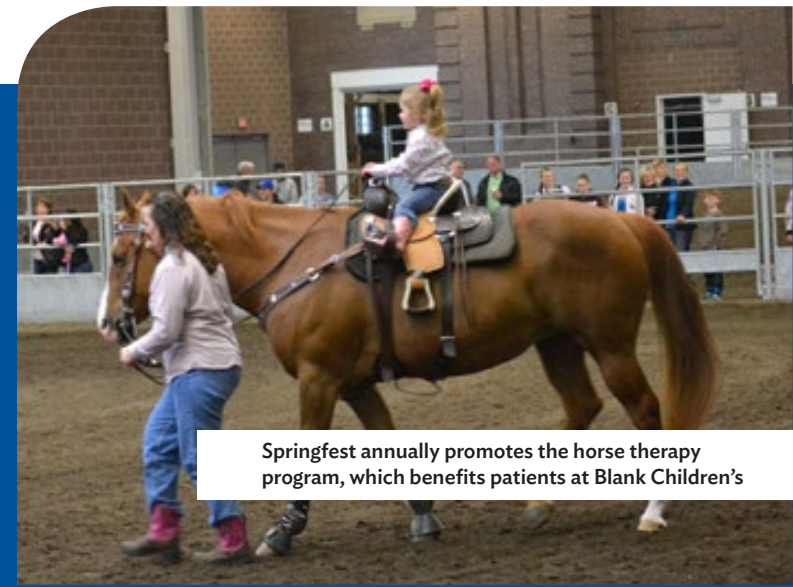
Springfest annually promotes the horse therapy program, which benefits patients at Blank Children's

The Center focuses on helping babies and children affected by drug exposure or abuse of any kind, so that they may live a healthier, happier life. Since 2002, Springfest provides an opportunity for those passionate about helping kids facing abuse to give back in a tangible way. Donations support diagnostic services and various support programs for child victims and their parents or caregivers, as well as public education and advocacy.