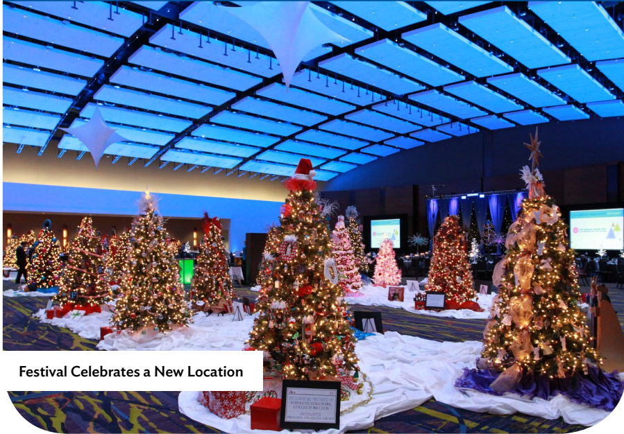
Festival Celebrates a New Location

The 29th annual Festival of Trees & Lights provided five days of holiday fun to more than 15,000 attendees, who enjoyed more beautifully decorated trees, children's activities, delicious food items, unique vendors and performances at Festival's new location, Veterans Memorial Community Choice Credit Union Convention Center Ballroom.