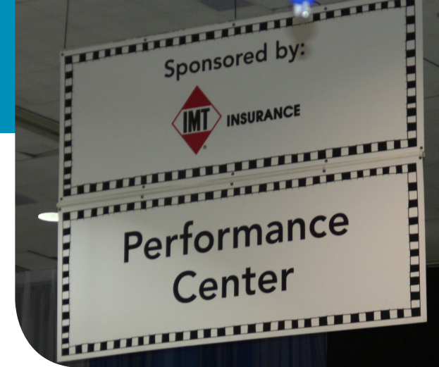
A IMT Group sponsorship sign at the 25th annual Festival of Trees & Lights

The 2013 Festival of Trees & Lights will celebrate its 30th anniversary November 27–December 1.