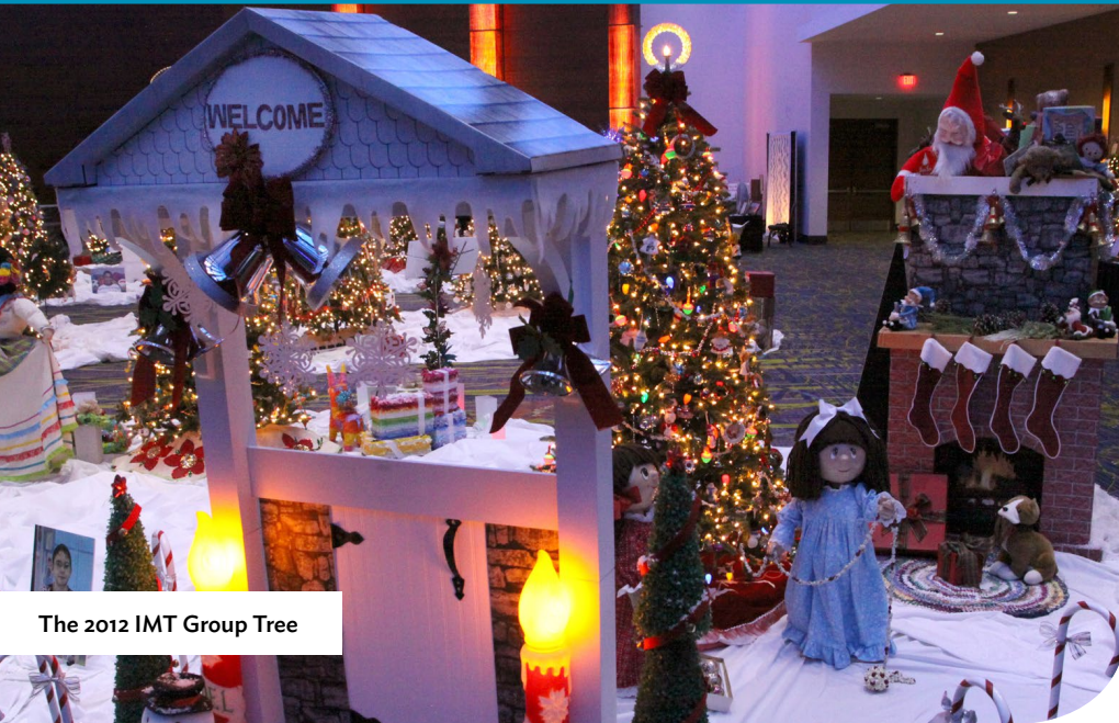
The 2012 IMT Group Tree