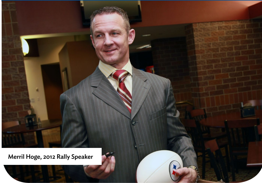
Merril Hoge, 2012 Rally Speaker

The 2012 Rally Against Cancer, a benefit for John Stoddard Cancer Center, was held on Saturday, January 28 at the Hy-Vee Conference Center in West Des Moines. More than 550 guests attended the event, and raised $215,000 to support the programs and services of John Stoddard Cancer Center. The proceeds from this event directly support the Stoddard Care Coordinator program, which is available to all Stoddard patients free of charge and is made possible through philanthropy.