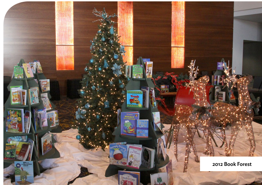
2012 Book Forest