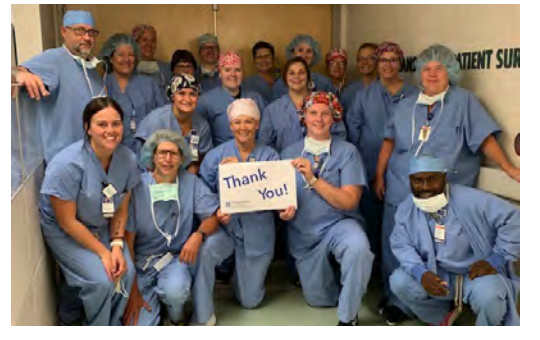
GRMC's surgery team joins together to say "thank you!"

The GRMC Foundation thanks everyone who responded to our Spring Annual Fund Drive Appeal. Seventy-seven donations were received for a total of $16,535 raised. Your support made the purchase of the cystoscope possible! A cystoscope helps our surgeons view the urinary tract to identify early signs of cancer, infection, narrowing, blockages or bleeding. Thank you for helping GRMC improve the health of the people and communities we serve.