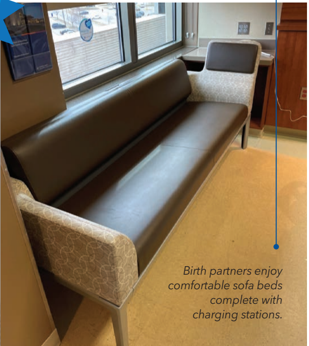
Birth partners enjoy comfortable sofa beds complete with charging stations.