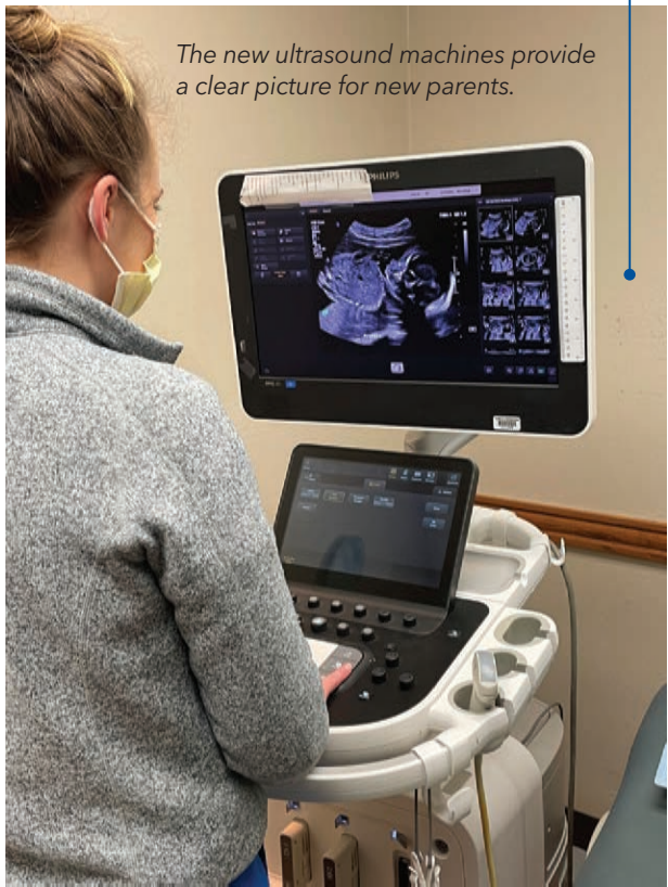
The new ultrasound machines provide a clear picture for new parents.